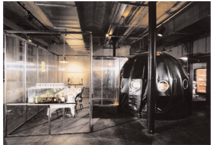
Figure 1. The Tissue Culture & Art Project, Disembodied Cuisine installation, Nantes, France, 2003.

As part of the TC&A project, we explore the ironies involved in the promise of a Victimless Utopia. In our Victimless Utopia series, we have explored the creation / construction of victimless meat in a project titled Disembodied Cuisine . [17] We ate, together with some brave volunteers, tiny semi-living frog steaks that were grown for more than two months in bioreactors and used not only expensive resources but also animal-derived ingredients in the nutrient media. [Fig. 1] We referred to them ironically as extreme Nouvelle Cuisine in the sense that they were luxury goods (and not necessarily tasteful ones). Still, the irony sometimes seems to be lost too easily, and now the discourse about a victimless society is being used by a university spin-off company that attempts to secure funding for tissue-engineered meat as a possibility for eating meat without killing the animal. [18]