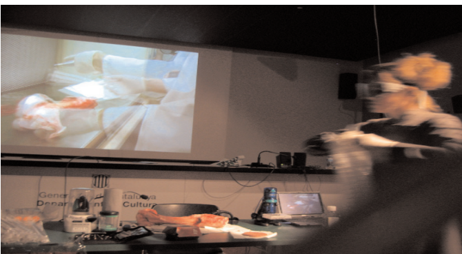
Figure 3. The Tissue Culture & Art Project, The DIY De-victimizer (2006). Performance.