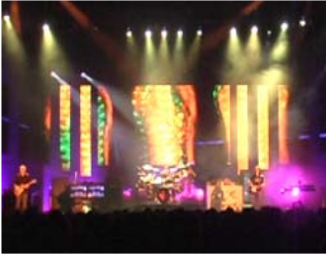
Designer in use on tour with Rush

Within three months, I was able to get going at a good level of expertise. I connected a MIDI device to some channel operators, used a particle system, and produced some interesting effects. This also told me how deeply I could potentially dive into Designer, and that three months would not be enough to really